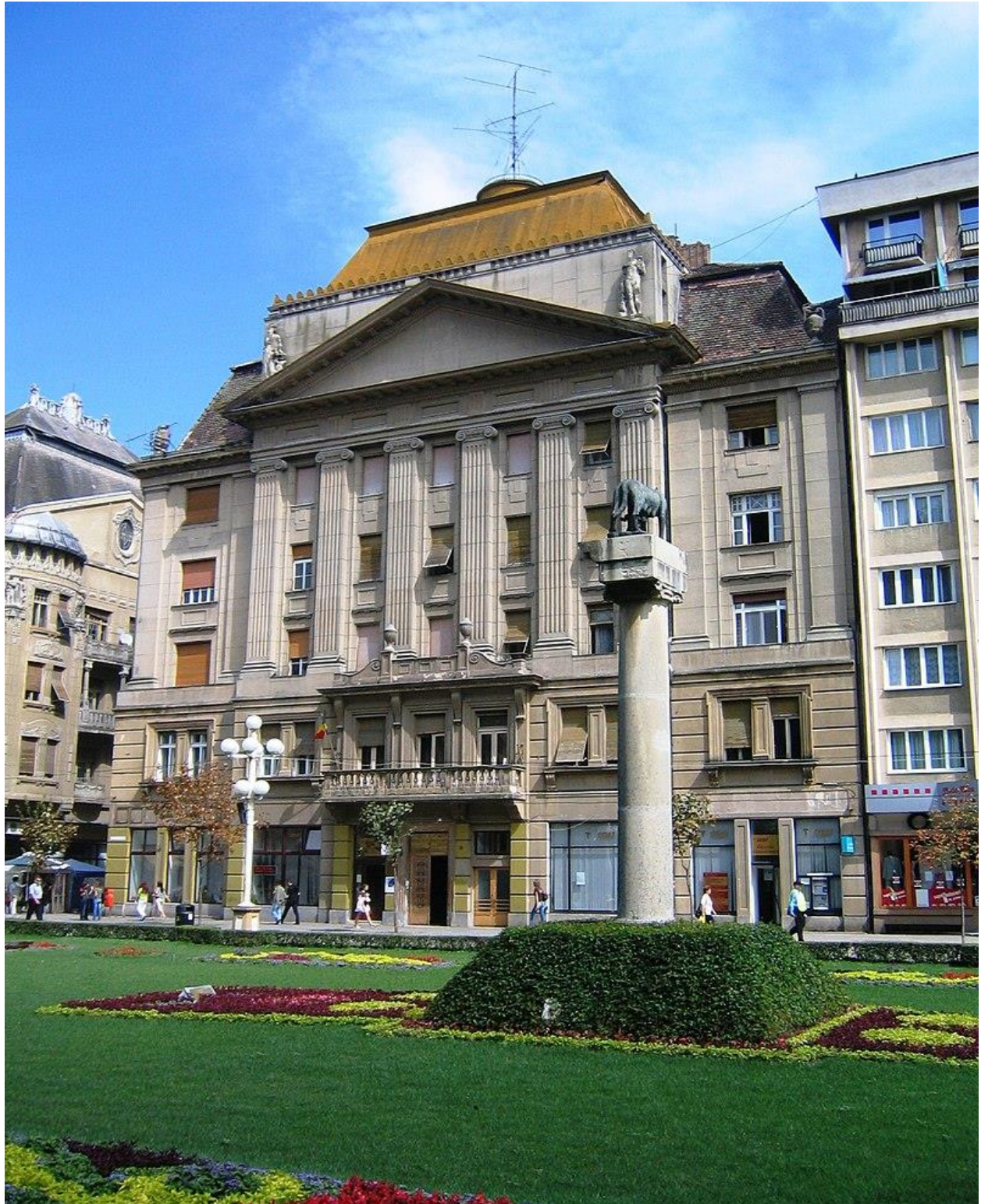
Timisoara Chamber of Commerce, Industry and Agriculture