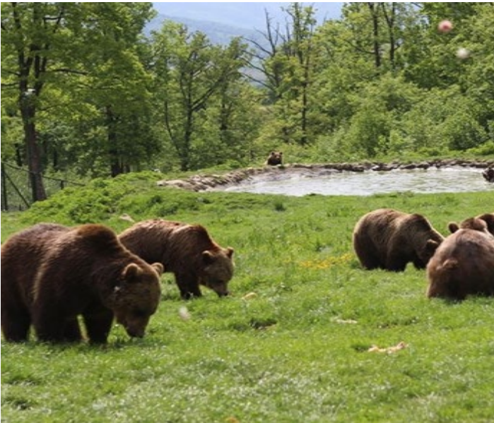
Liberty Bear Sanctuary